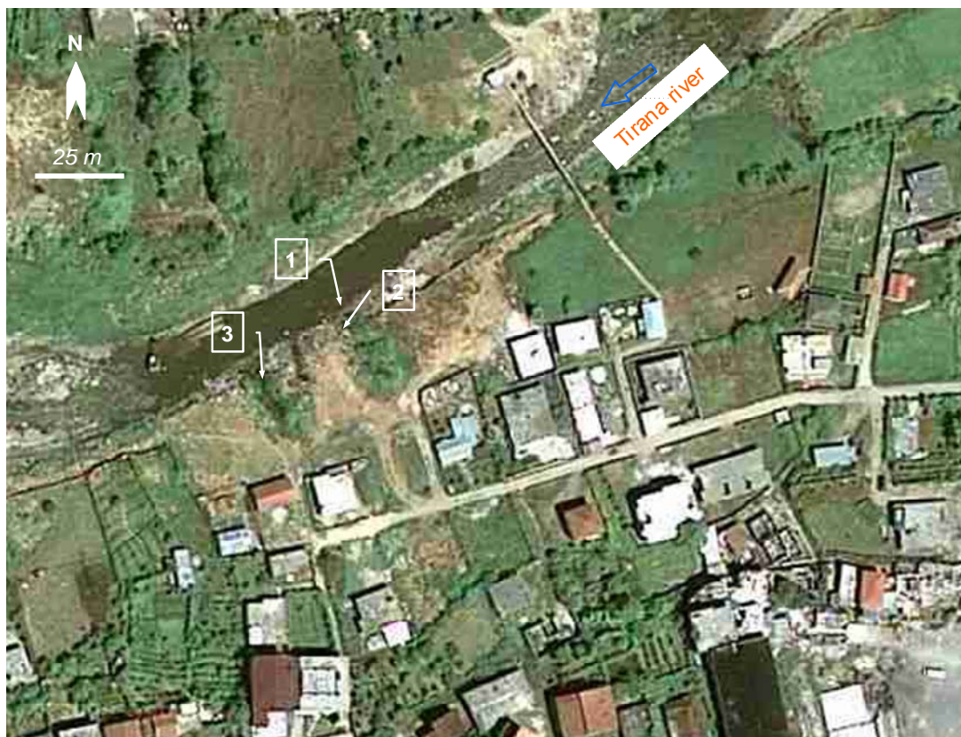
Figure 2. Satellite view of the three stations in the river place Bregu Lumit (elaborated after Image © Terremetrics, Europe Technologies and Digital Globe, Google Earth 2008).