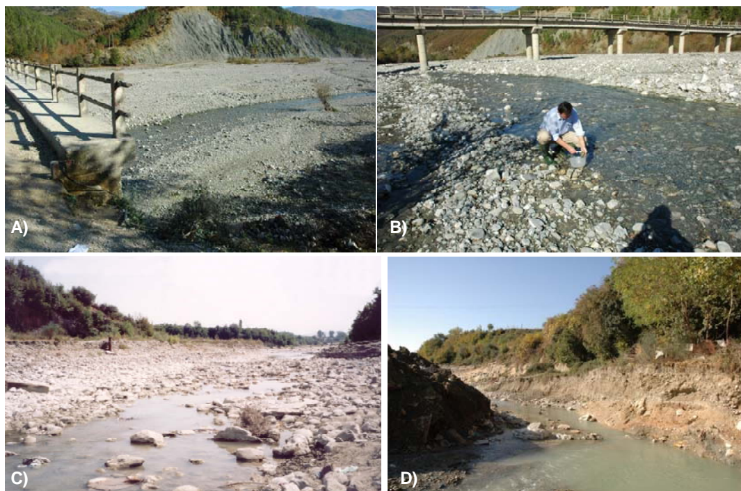
Figure 4. Photos from Tirana river in upstream part of the sampling place Bregu Lumit: A-B) views of the river in Zall Dajti village; C-D) views from the river in Brari village, just approaching the Tirana town, in the year 2002 (C) and in the year 2006 (D)

From the microbiological data reported in the table 6, if compared with the EU Standard ISO 7899-1 (Tab. 3), the situation of the place seems extremely bad, as suspected; the values of fecal coliforms and total coliforms are several fold higher even for the respective guide values for very bad waters. The presence of fecal coliform bacteria in aquatic environments indicates that the water has been contaminated with the fecal material of man or other animals. At the time this occurred, the source water may have been contaminated by pathogens or disease producing bacteria or viruses which can also exist in fecal material. Some waterborne pathogenic diseases include typhoid fever, viral and bacterial gastroenteritis and hepatitis A. The presence of fecal contamination is an indicator that a potential health risk exists for individuals exposed to this water. Fecal coliform bacteria may occur in ambient water as a result of the overflow of domestic sewage or nonpoint sources of human and animal waste.