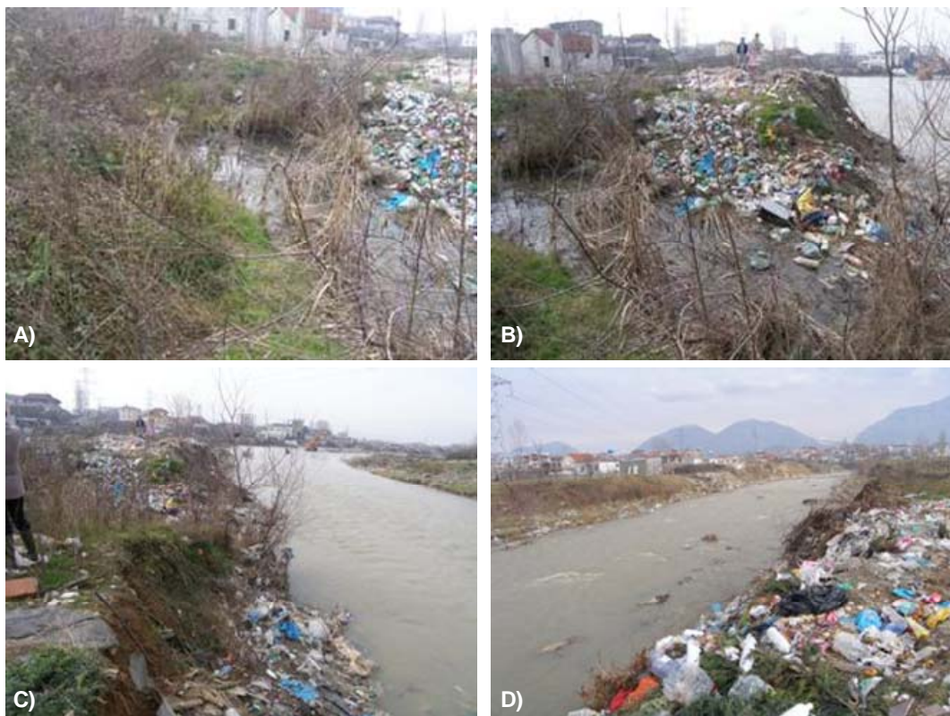
Figure 3. Photos from the river place Bregu Lumit: A-B) view of the discharge channel (sampling station 2); C-D) views from the down and upstream parts of the river (sampling station 1) (Photos A. Miho).

along. The riverbed is build up of gravel and stones; the water course was higher than normal, due to the heavy rainfall during previous period; the color of the water was green milky, highly turbid, due to the high amount of suspended solids. Riverbed as the riverbanks was heavily spoiled with plastic garbage and other solid waste. The photos in the figure 3 show different view from the discharge channel (A and B) and from the river place Bregu Lumit (C and D).